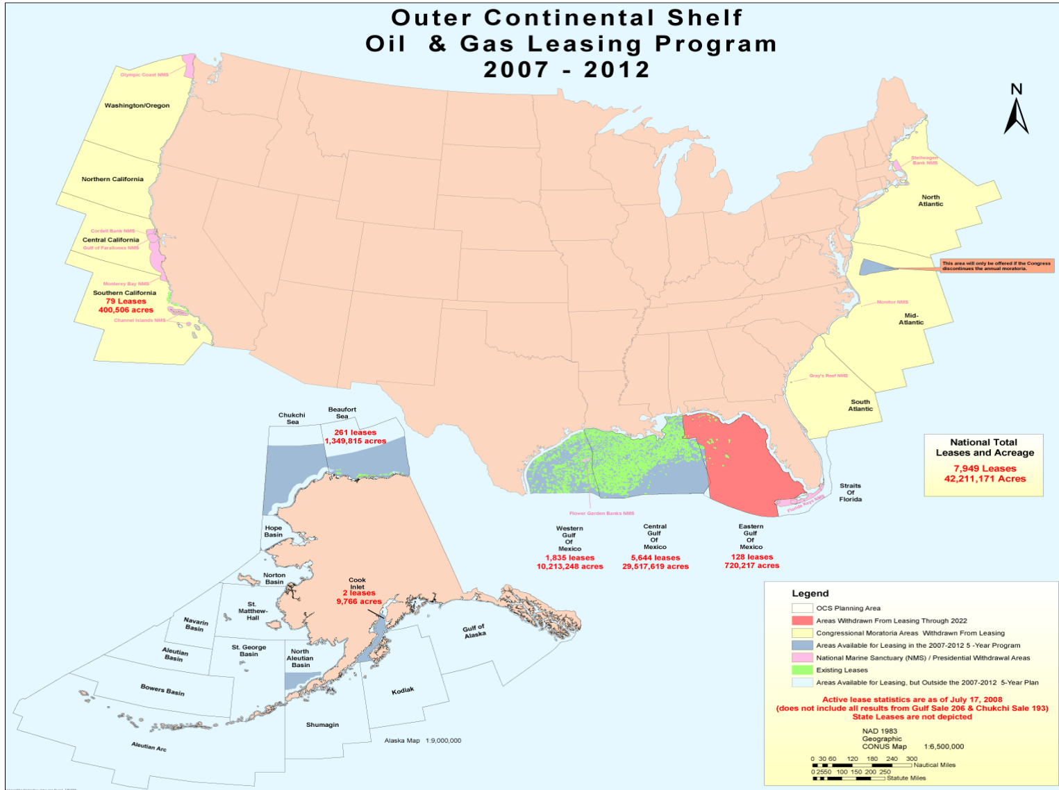
Figure 1. MMS Five-Year Program Areas

Source: Minerals Management Service, 2002-2007-Year Leasing Program. MMS defines the OCS as submerged lands, subsoil, and seabed between the seaward extent of states' jurisdiction and the seaward extent of federal jurisdiction.