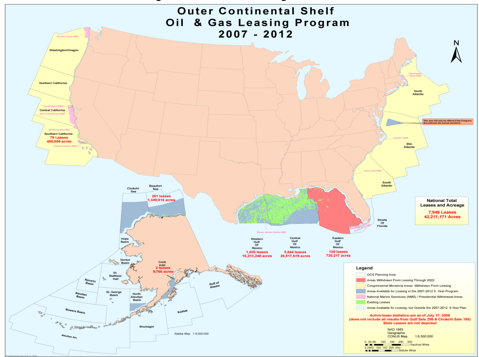
Figure 1. MMS Five-Year Program Areas

Source: Minerals Management Service, 2002-2007-Year Leasing Program. MMS defines the OCS as submerged lands, subsoil, and seabed between the seaward extent of states' jurisdiction and the seaward extent of federal jurisdiction.