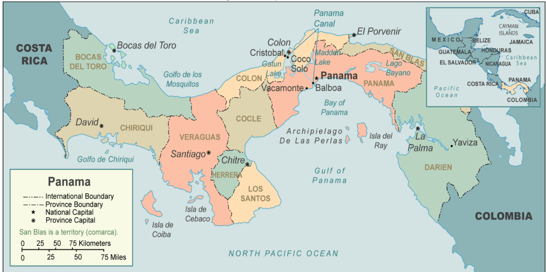
Figure 1. Map of Panama