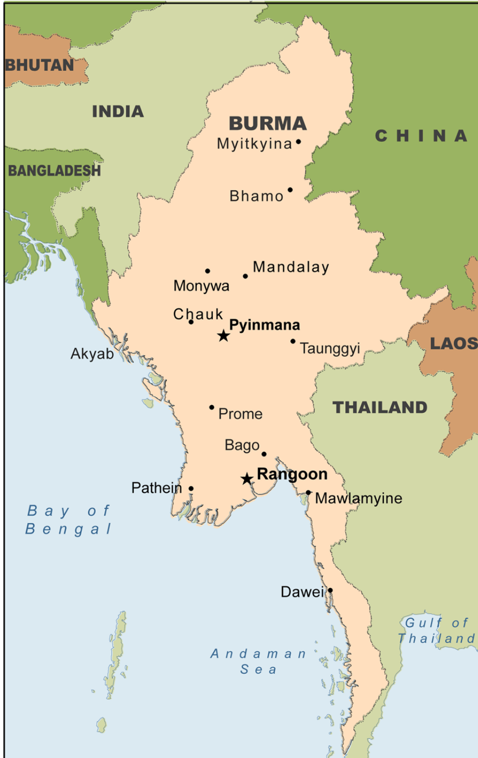
Figure 2. Map of Burma