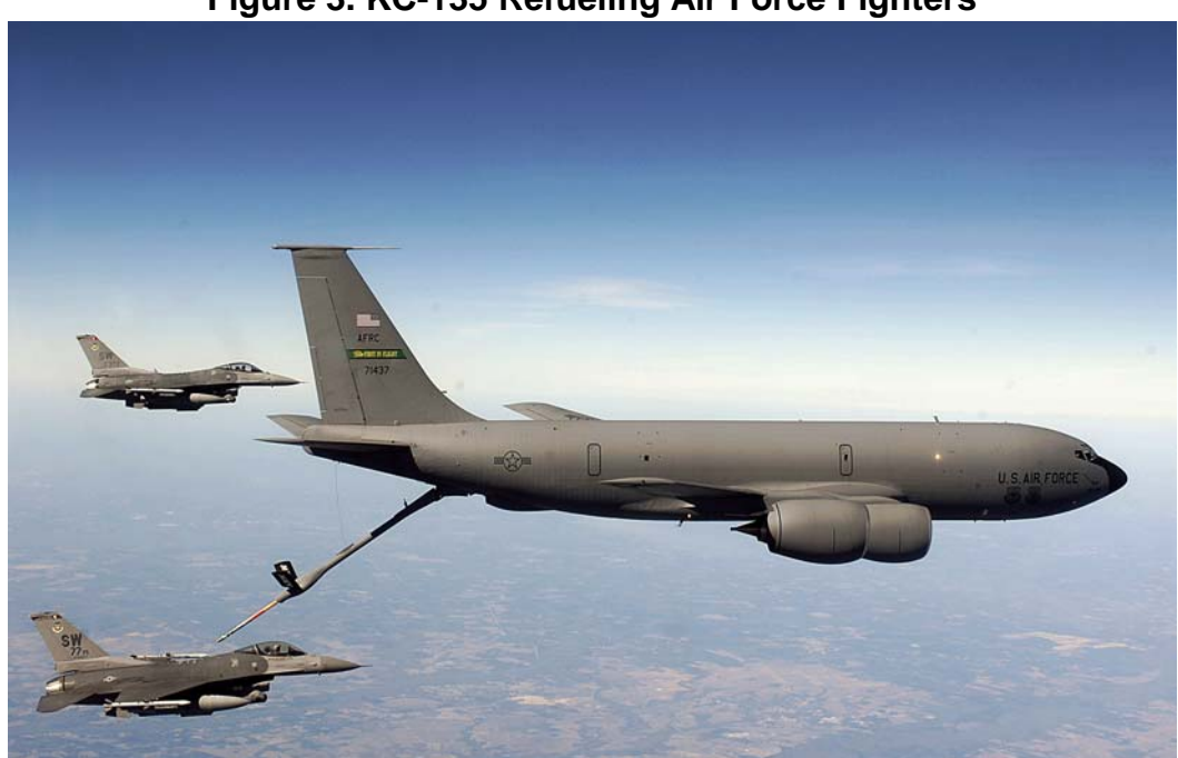
Figure 3. KC-135 Refueling Air Force Fighters