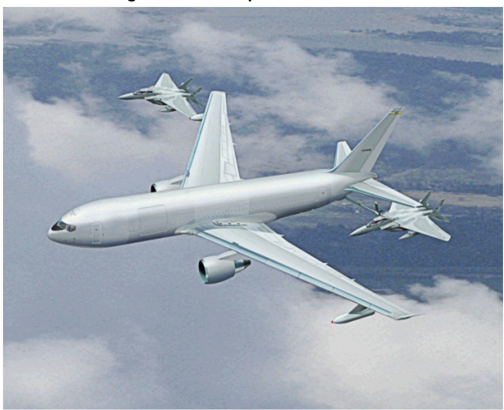
Figure 5. Artist Impression of KC-767