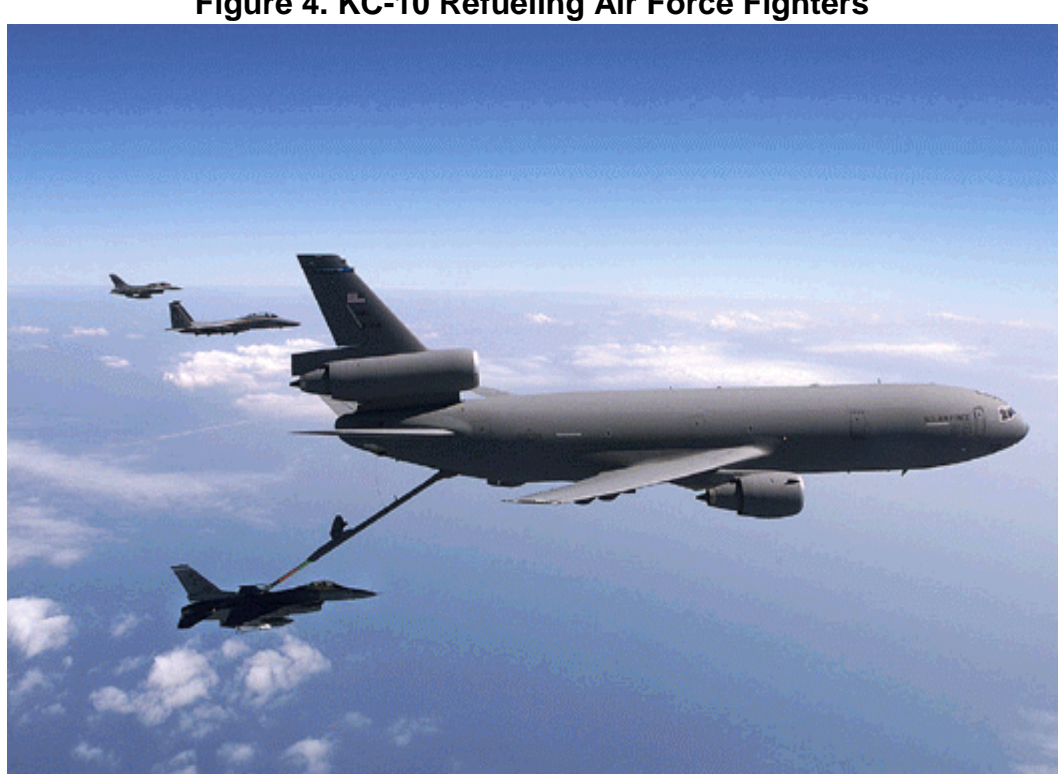
Figure 4. KC-10 Refueling Air Force Fighters