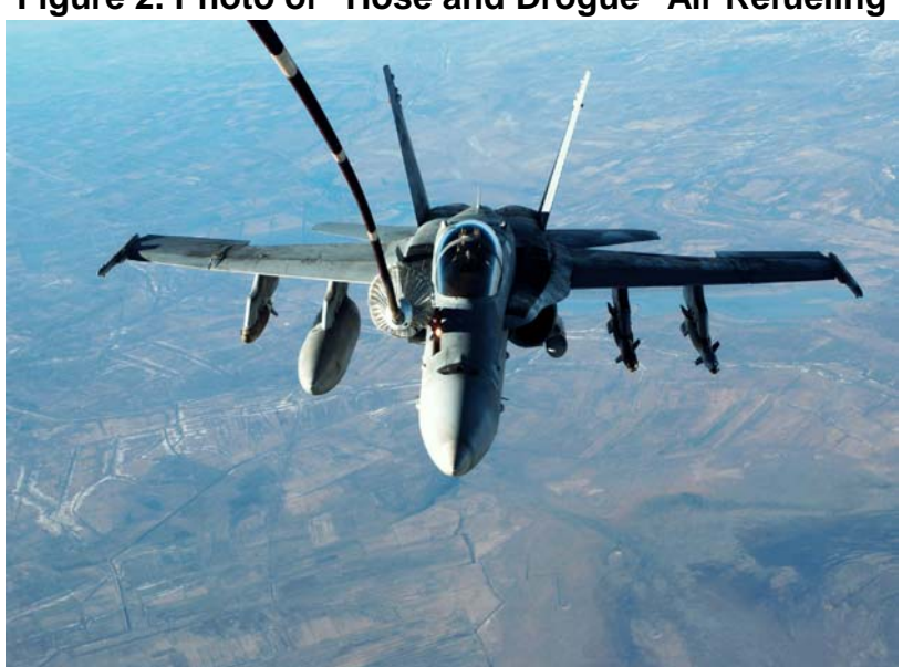
Figure 2. Photo of "Hose and Drogue" Air Refueling

Both the KC-10 and KC-135, can perform both "Boom" and "Drogue" refueling. However, while KC-10s can refuel either type on the same mission, most KC-135s must be converted from "Boom" refueling to "Drogue" or vice versa on the ground. This limitation reduces the KC-135s effectiveness in comparison to the KC-10 and potentially in comparison to the KC-X which is expected to be equipped to refuel both receiver types on the same mission. Figure 2 illustrates hose and drogue refueling.