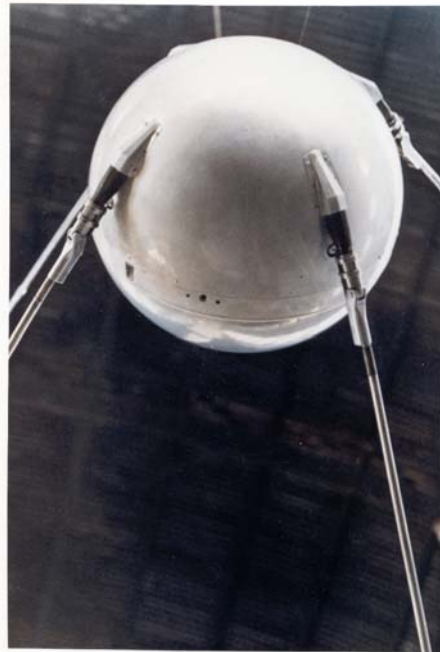
Figure 1. Sputnik