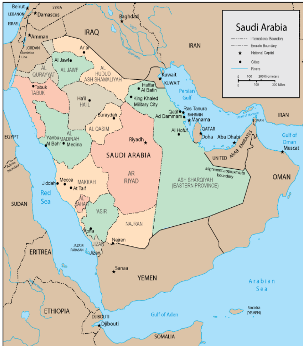
Figure 1. Map of Saudi Arabia