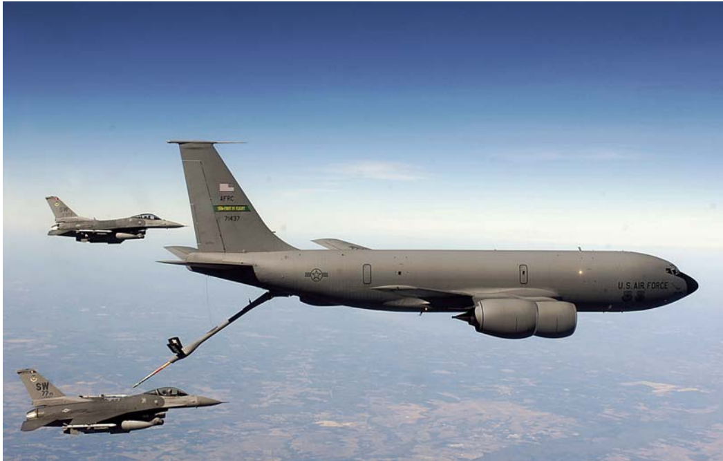
Figure 4. KC-135 Refueling Air Force Fighters