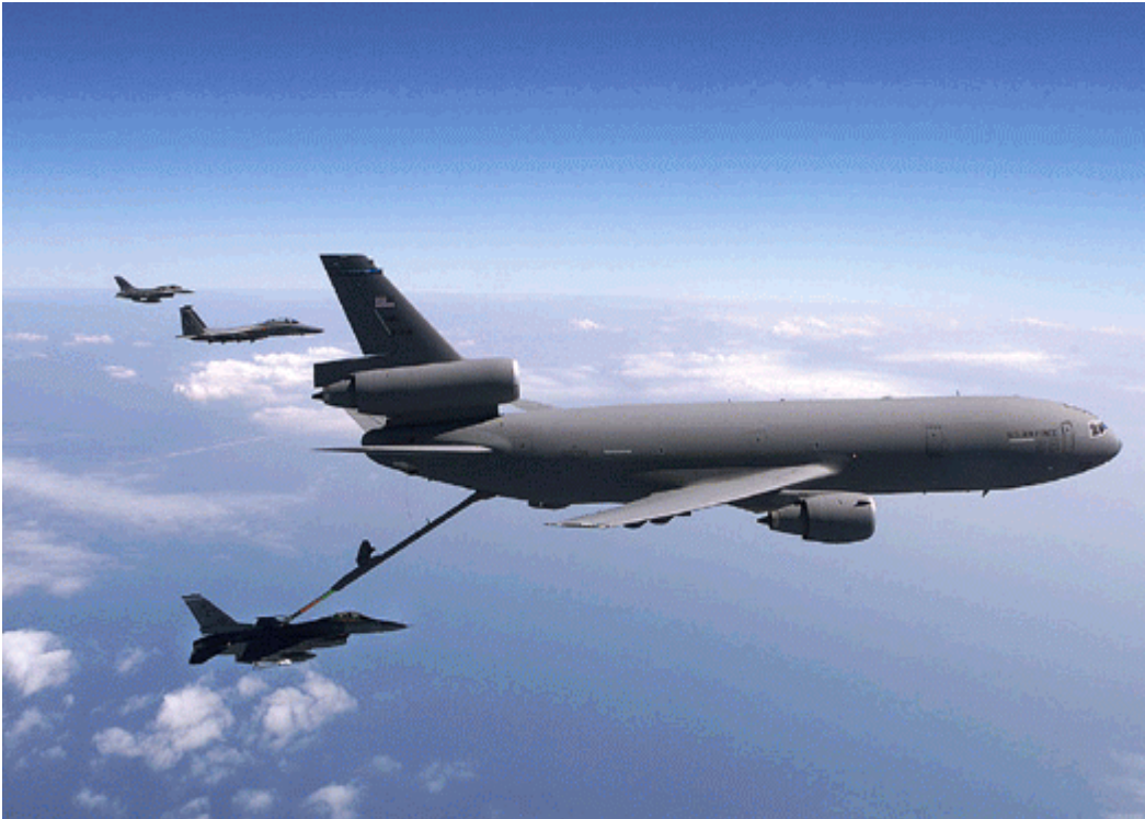
Figure 5. KC-10 Refueling Air Force Fighters