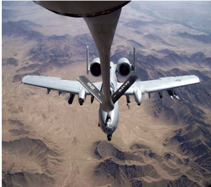
Figure 1. Photo of “Boom” Air Refueling

Boom vs. Probe and Drogue Air Refueling. Receiver aircraft can be equipped to refuel from a boom (most Air Force aircraft) or with a probe and drogue (most Navy, Marine Corps, and allied aircraft). Operational planners must ensure tasked tankers are equipped to connect with their scheduled receiver. 24 Figure 1 contains an example of “boom” air refueling.