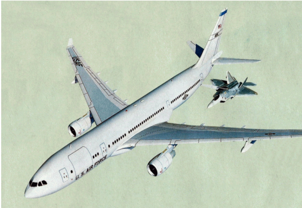
Figure 7. Artist Impression of KC-30