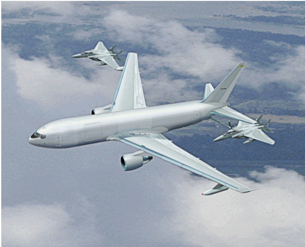
Figure 6. Artist Impression of KC-767