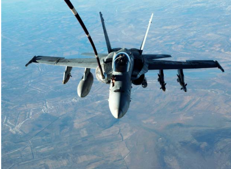
Figure 2. Photo of “Hose and Drogue” Air Refueling