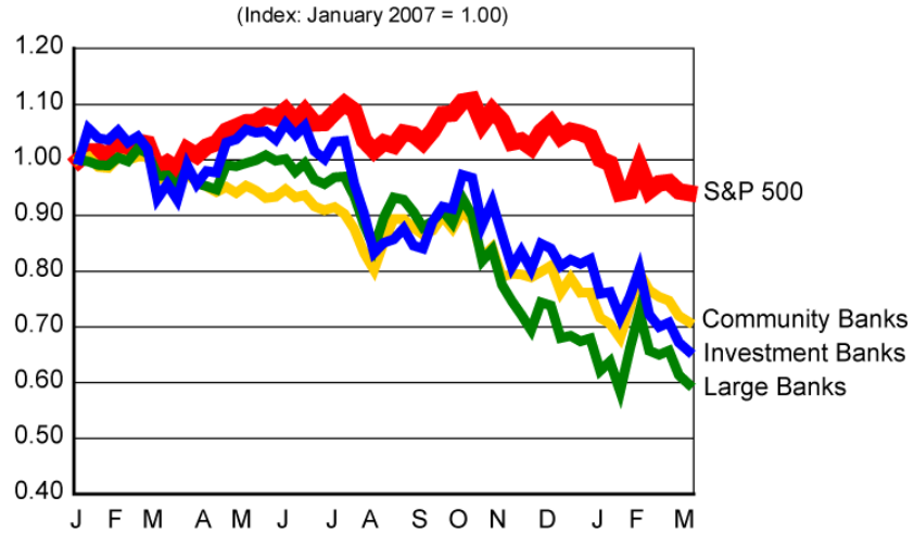
Figure 1. Commercial and Investment Bank Stock Indexes, January 2007- March 2008