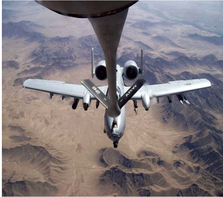
Figure 1. Photo of “Boom” Air Refueling

Boom vs. Probe and Drogue Air Refueling. Receiver aircraft can be equipped to refuel from a boom (most Air Force aircraft) or with a probe and drogue (most Navy, Marine Corps, and allied aircraft). Operational planners must ensure tasked tankers are equipped to connect with their scheduled receiver. 22 Figure 1 contains an example of “boom” air refueling.