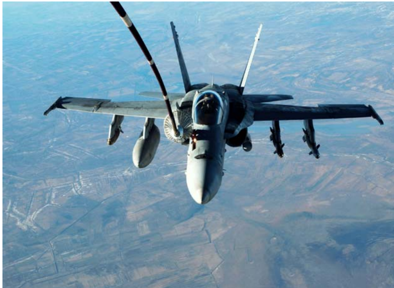
Figure 2. Photo of “Hose and Drogue” Air Refueling