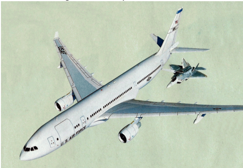
Figure 7. Artist Impression of KC-30