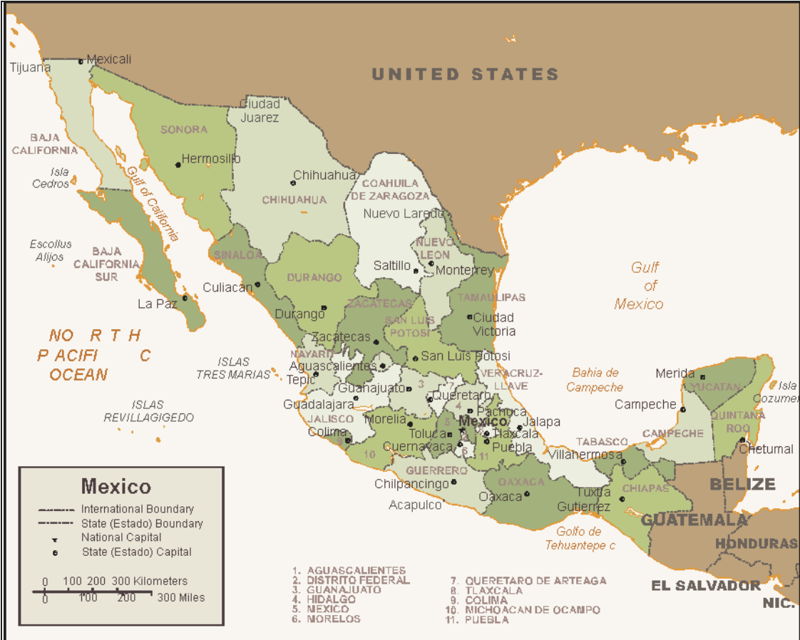
Figure I. Map of Mexico