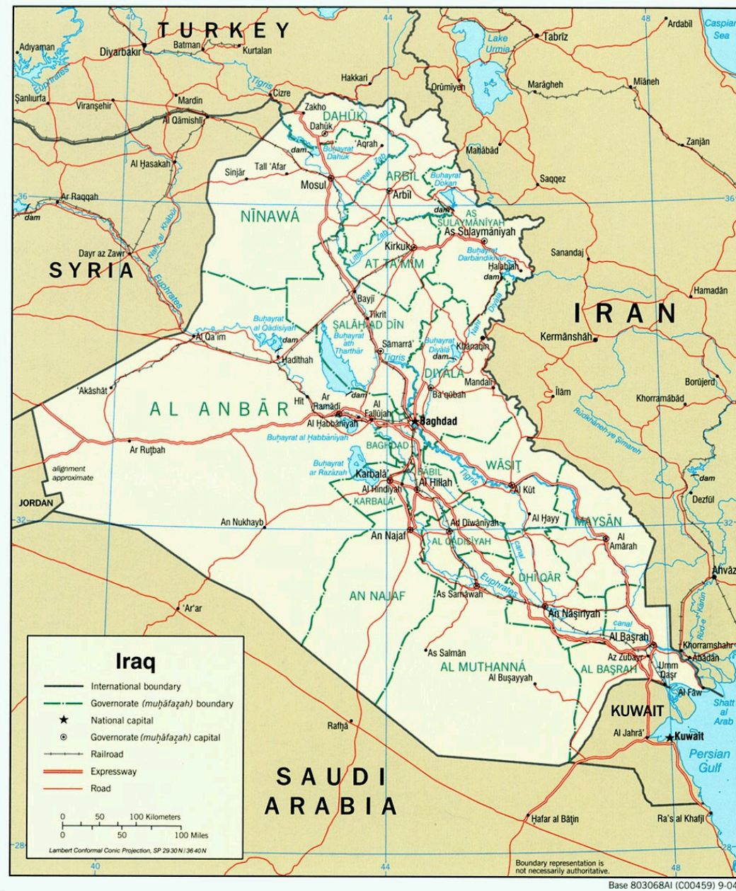
Figure 1. Map of Iraq