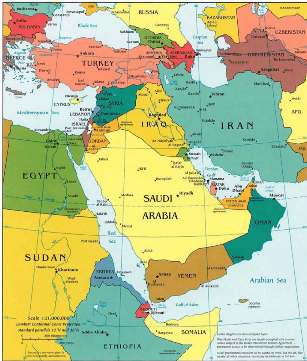
Figure 2. Map of Middle East