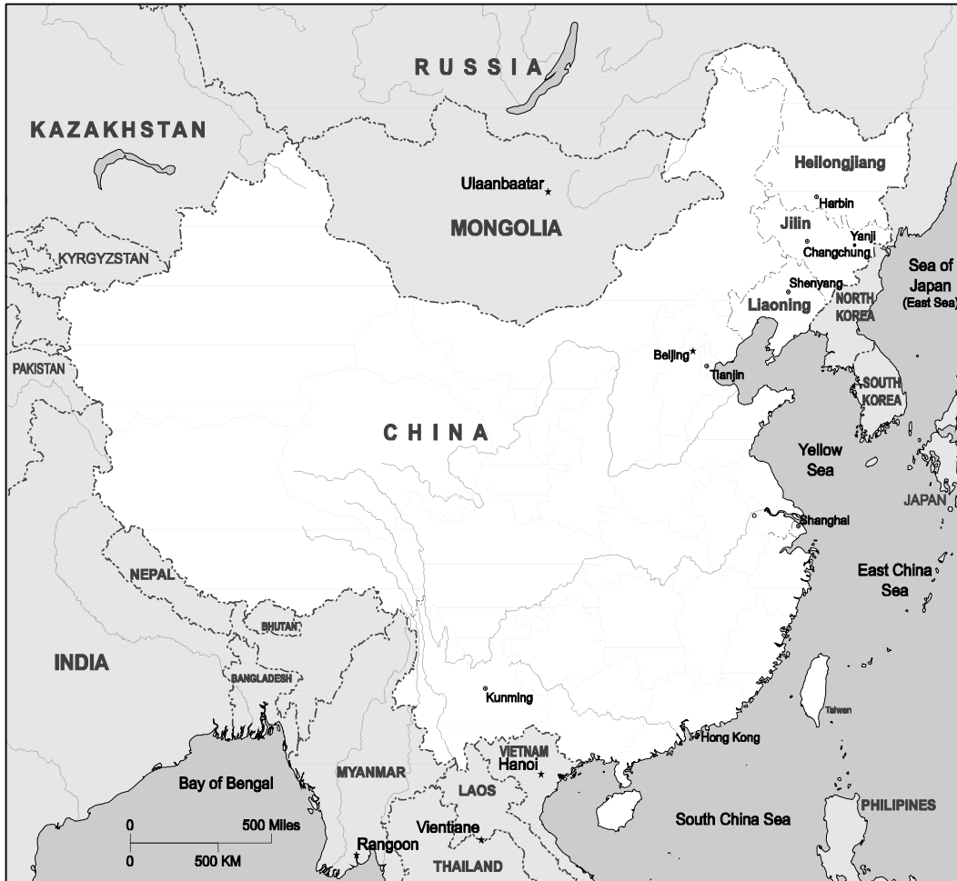
Figure 1. Regional Perspective on North Korea and China