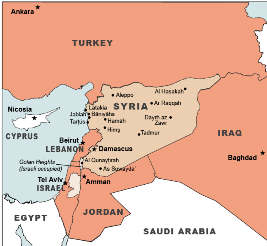
Figure 2. Map of Syria

Iraqi Refugees in Syria. Since the overthrow of the Saddam Hussein regime, Iraqi refugees seeking to escape privation and insecurity have fled in large numbers to Syria and Jordan. Syrian officials reportedly estimate that as many as a 1.7 million Iraqi refugees have settled at least temporarily in the Damascus suburbs, changing the character of entire neighborhoods and creating strains on the Syrian domestic economy in the form of rising rents, housing demands, and impending water and electricity shortages. Many destitute Iraqi women have reportedly turned to prostitution to support their families, as Iraqis are barred from working legally. Syrian authorities had kept an open door policy regarding new arrivals; however, in September 2007, the government imposed a strict new visa requirement on Iraqis which is expected to halt the steady stream of several thousand Iraqi refugees who enter Syria each day. The Syrian government has sought assistance from the international community in dealing with the Iraqi refugee issue.