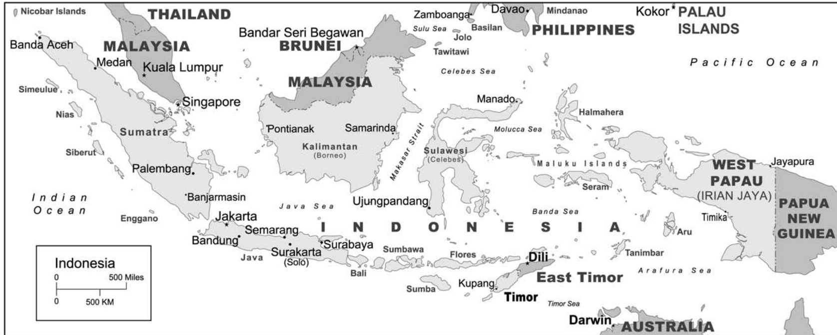
Figure 2. Indonesia