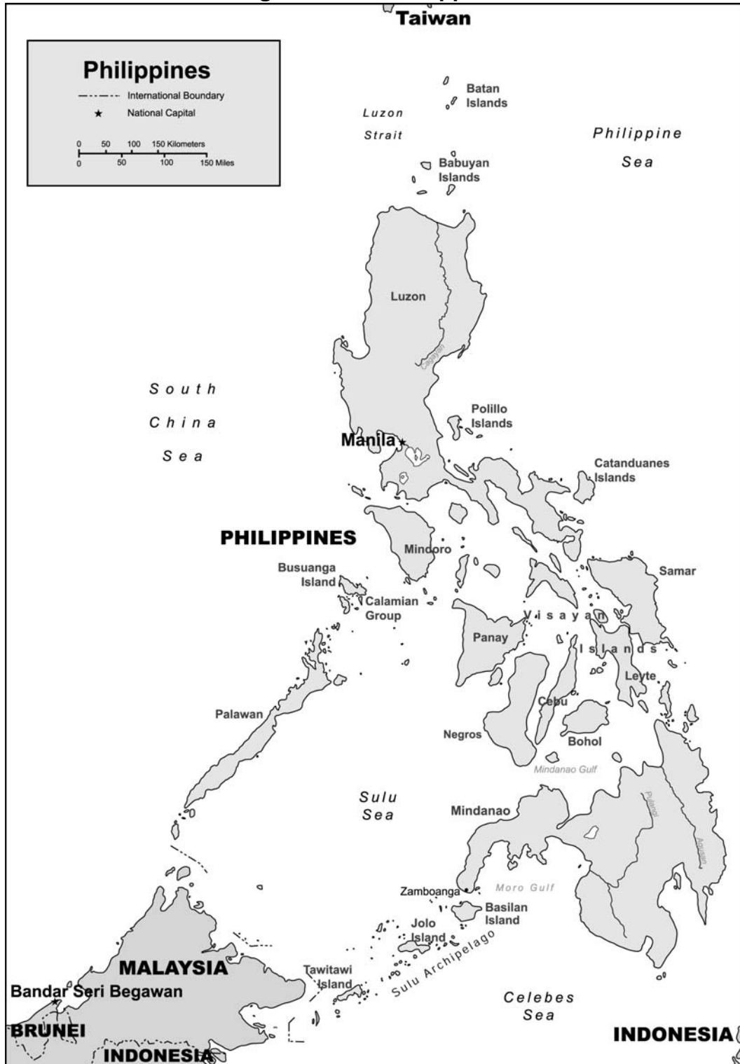
Figure 4. The Philippines