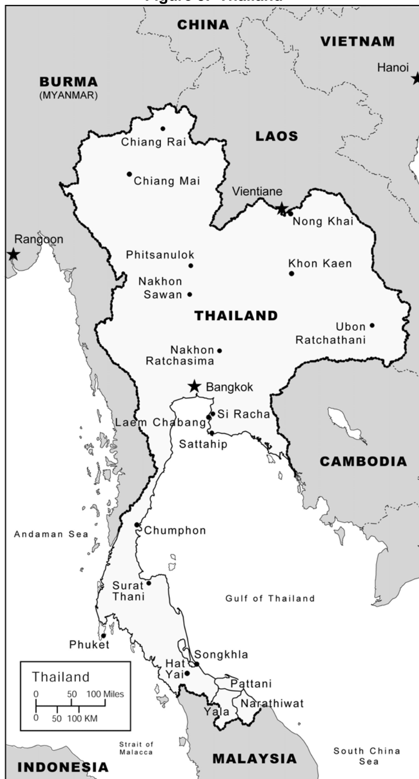
Figure 5. Thailand