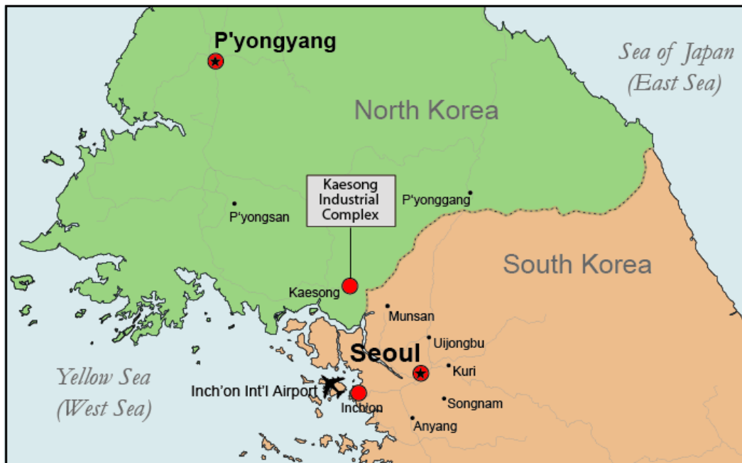
Figure 1. Location of the Kaesong Industrial Complex

Source: Map Resources. Adapted by CRS. 06/07