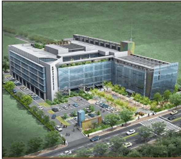
Figure 2. Leased Space Factory Building to be Constructed in the Kaesong Industrial Complex