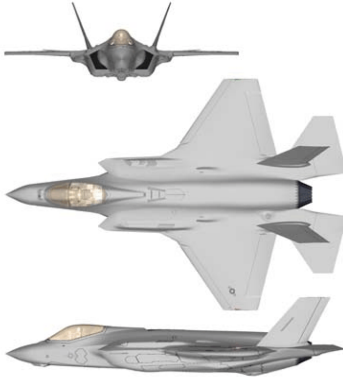
Figure 1. F-35 Lightning II Joint Strike Fighter

leaders have said Air Force STOVL variants would number “in the hundreds.” 5 In December 2004, Air Force leaders confirmed long-running speculation that it would reduce its total purchase of JSFs. Some observers believe it will be by as much as one-third of the 1,763 figure. 6