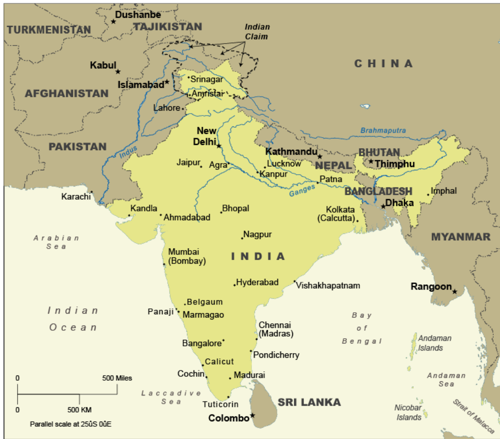
Figure 2. Map of India

Source: Map Resources. Adapted by CRS. (2/2007)