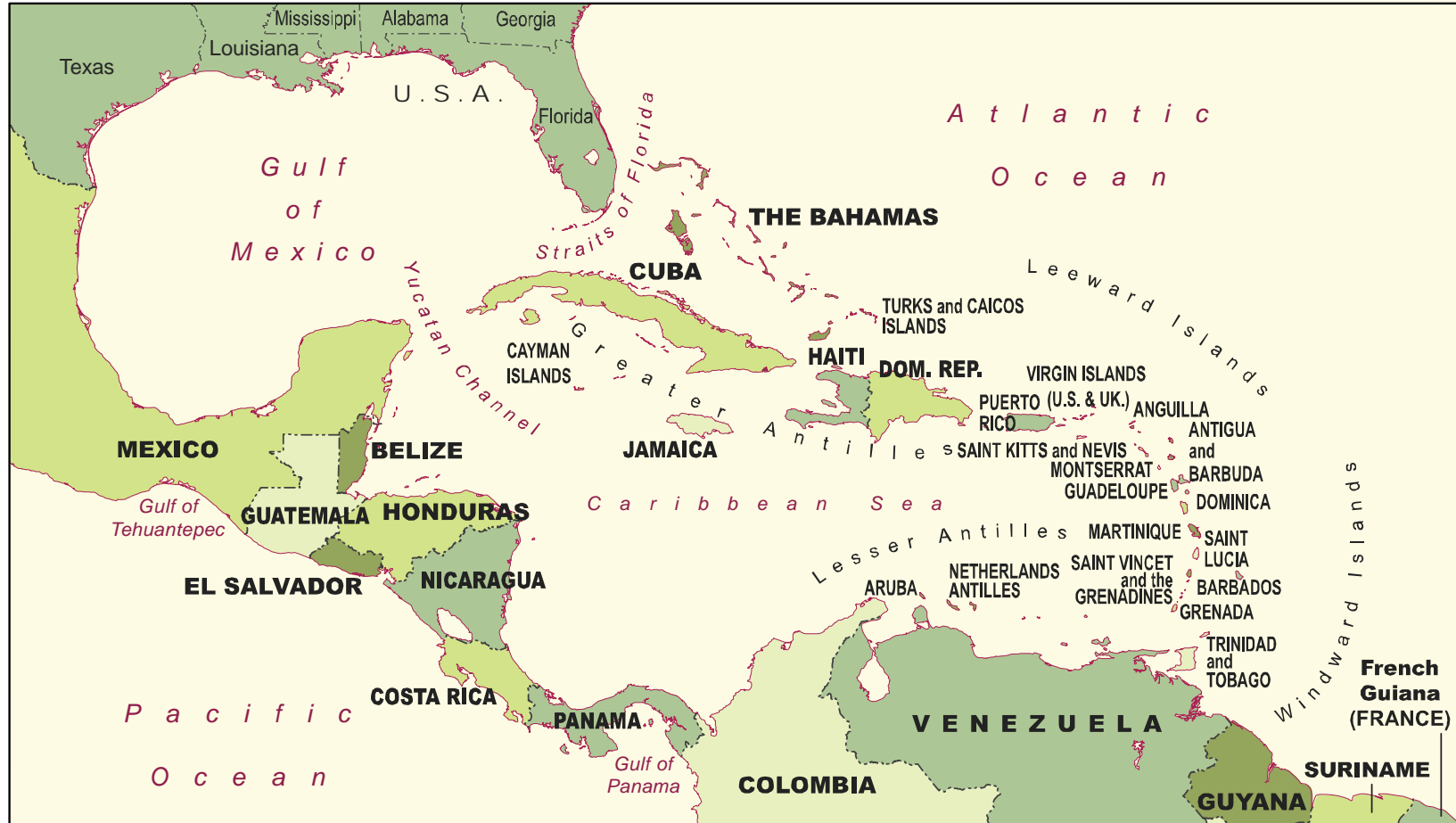
Figure 1. Map of the Caribbean Basin Region