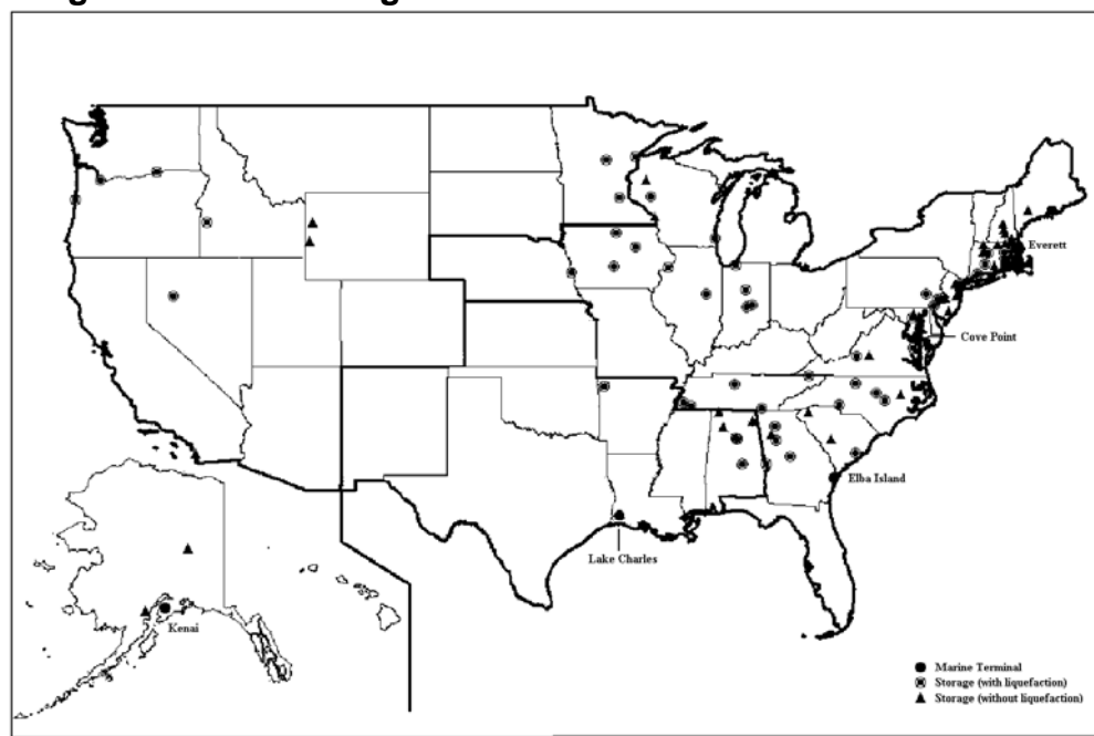
Figure 3. LNG Storage Sites in Utilities and Marine Terminals

According to the Energy Information Administration (EIA) there were approximately 100 active LNG storage facilities in the United States distributed among approximately 55 utilities as of August, 2005.<sup>21</sup> These facilities are mostly in the Northeast where pipeline capacity and underground gas storage have historically been constrained. Figure 3 shows the locations of U.S. LNG storage facilities within utilities and on-shore terminals.<sup>22</sup>