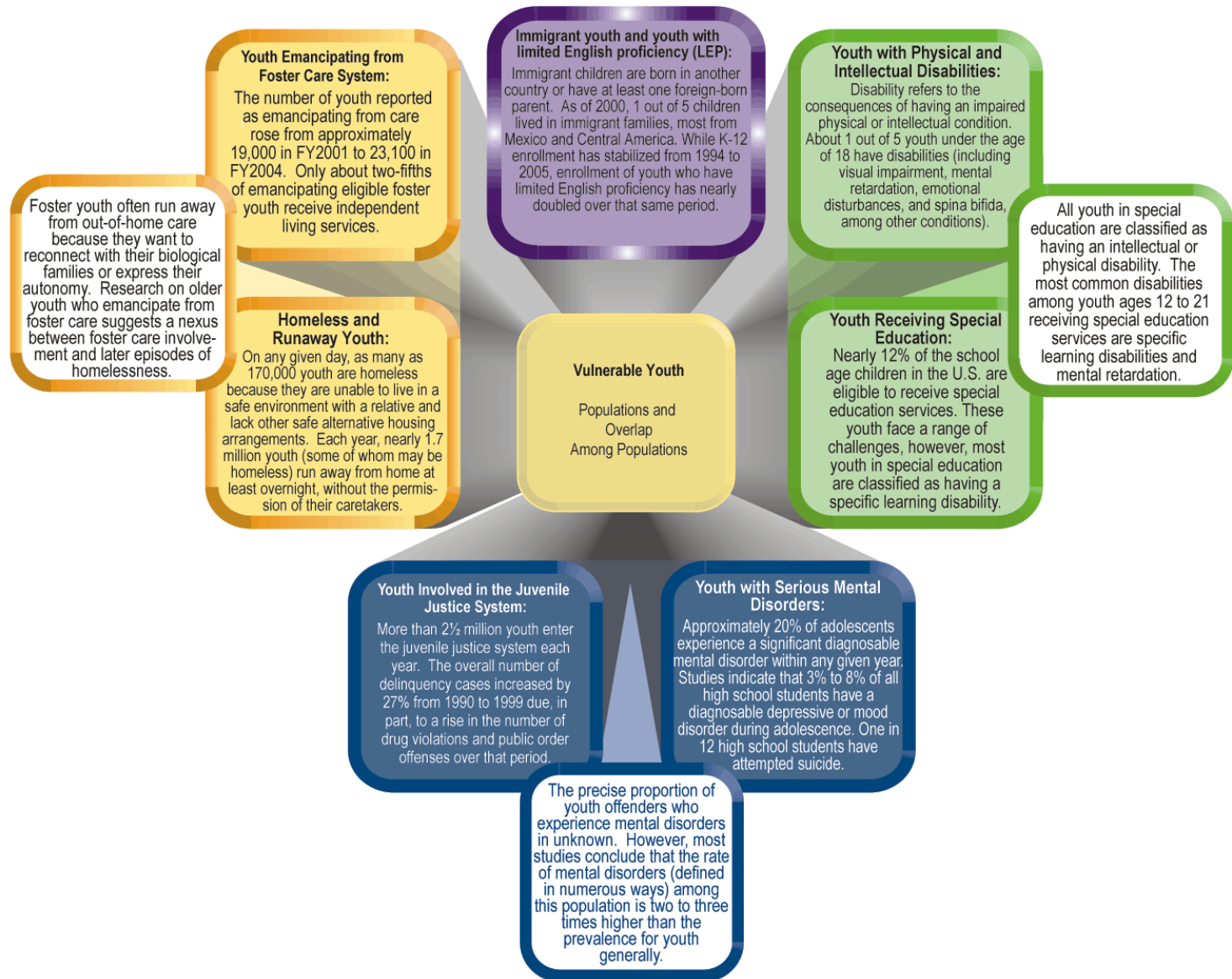
Figure 1: Vulnerable Youth Groups and Overlap Among Groups