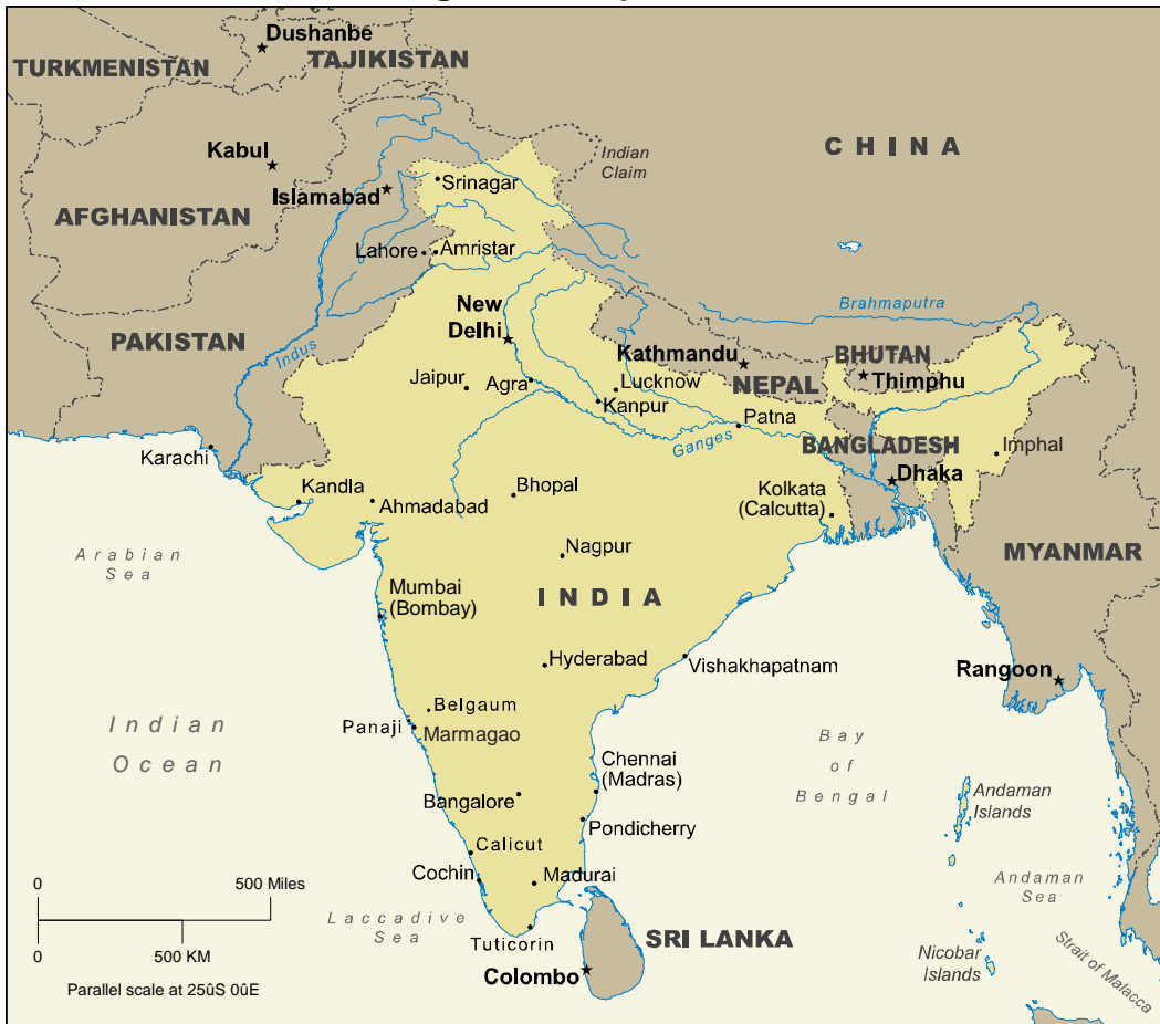
Figure 2. Map of India