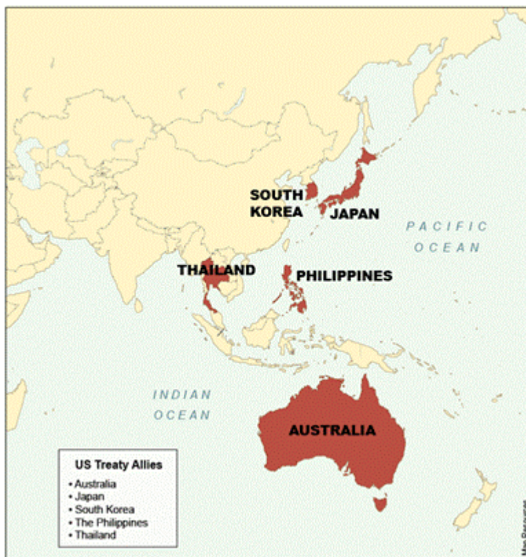
Figure 3. The United States Treaty Allies in Asia

Former Defense Minister Kim Beazley of Australia asserts that none of America's San Francisco alliance system partners have yet "found other regional and bilateral relationships sufficiently attractive to eschew the benefits of this older security framework." Some alliance relationships have grown stronger over time as in the case of Australia and Japan. That said, others have experienced difficulties. Thailand is viewed as seeking to balance its American relationship with one with China; New Zealand was de facto dropped from the Australia-New Zealand-United States (ANZUS) alliance in the mid 1980s; poor relations with the Philippines led the United States to leave its military bases there in 1992 and there are signs of emerging differences in the U.S.-Republic of Korea relationship. Despite these developments, the system has endured because the correlates of power in post war Asia have not "altered in a way that suggests that the United States is not a useful balancer of last resort." 53 Figure 3 shows the locations of the United States' regional allies.