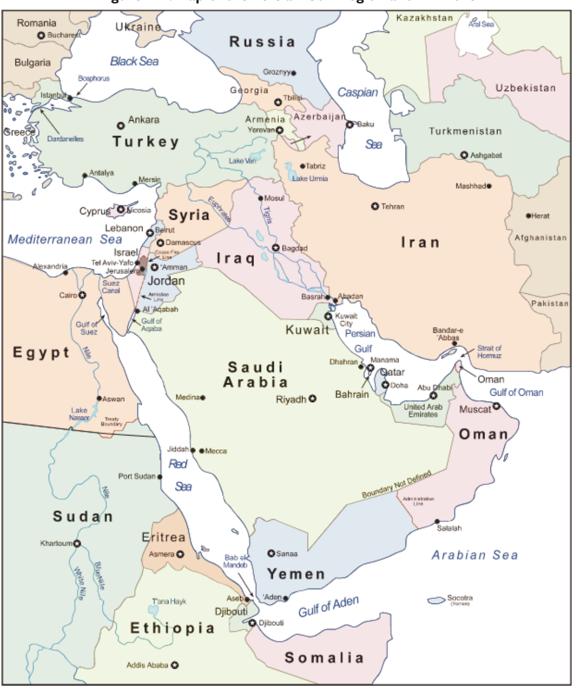
Figure A-I. Map of the Persian Gulf Region and Environs