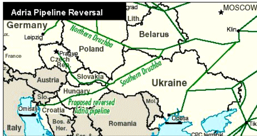
Figure 2. Druzhba and Adria Oil Pipelines