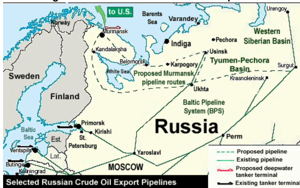
Figure 3. Selected Northwestern Oil Pipelines