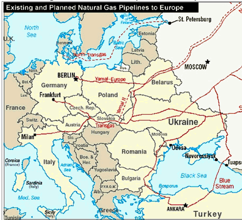
Figure 5. Natural Gas Pipelines to Europe