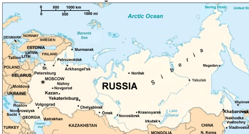
Figure 1. Russia