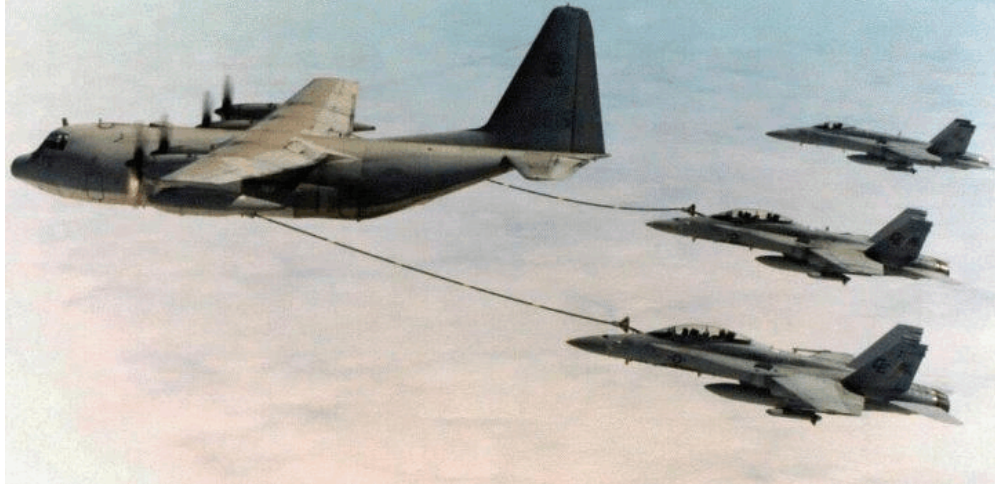
Figure 2. USMC KC-130 Refueling F/A-18s with Hose-and-Drogue

A single flying boom can transfer fuel at approximately 6,000 lbs per minute. A single hose-and-drogue can transfer between 1,500 and 2,000 lbs of fuel per minute. Unlike bombers and other large aircraft, however, fighter aircraft cannot accept fuel at the boom's maximum rate. (Today's fighter aircraft can accept fuel at 1,000 to 3,000 lbs per minute whether from the boom or from the hose-and-drogue.) 2 Thus, the flying boom's primary advantage over the hose-and-drogue system is lost when refueling fighter aircraft.