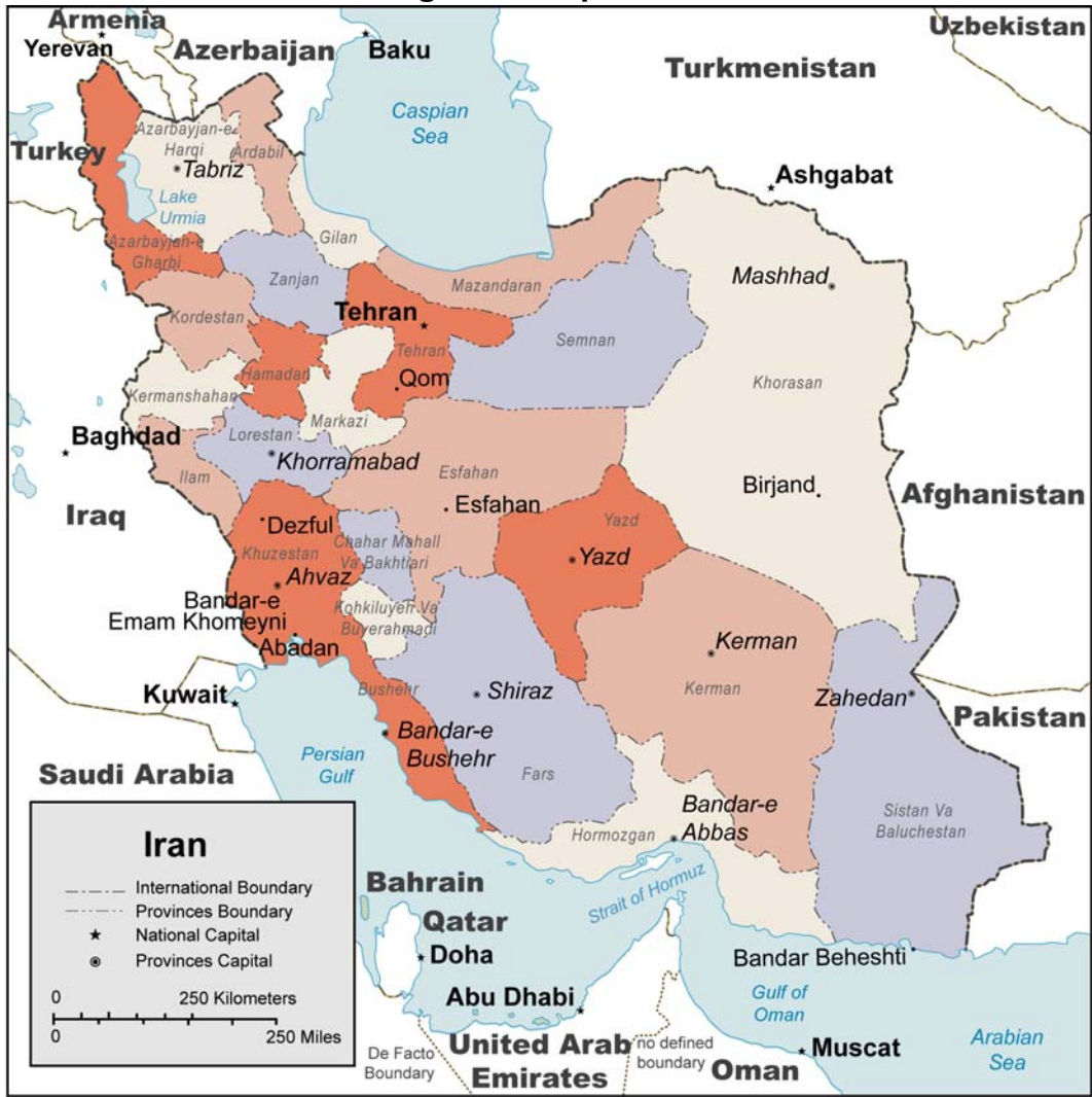
Figure 1. Map of Iran

Source: Map Resources. Adapted by CRS. (K.Yancey 4/12/05)