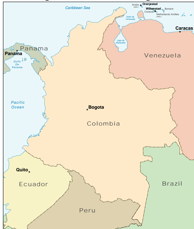
Figure 3. The Andean Region