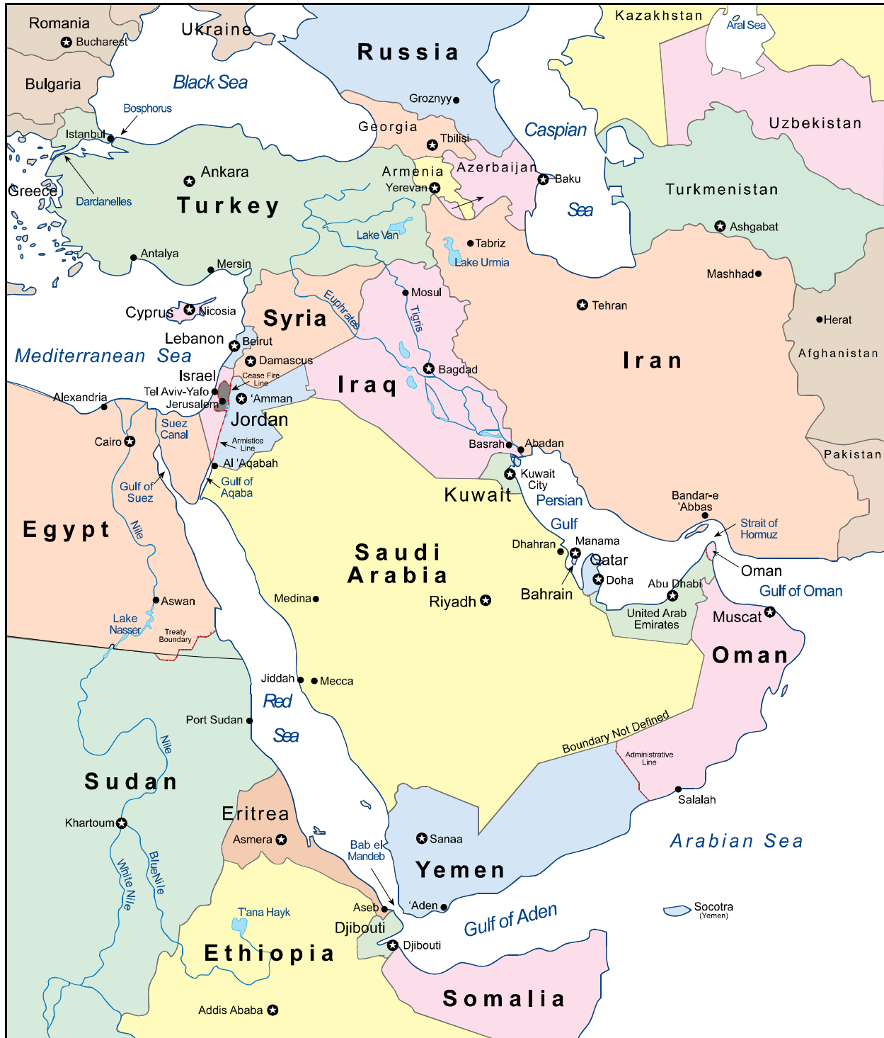
Figure 2. Map of the Persian Gulf Region and Environs

Adapted by CRS from Magellan Geographix. Used with permission.