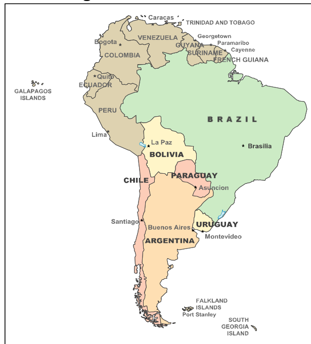
Figure 4. South America