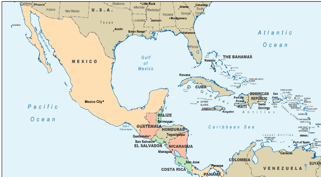
Figure 5. Mexico and Central America

Source: Map Resources. Adapted by CRS. (K.Yancey 4/18/04)