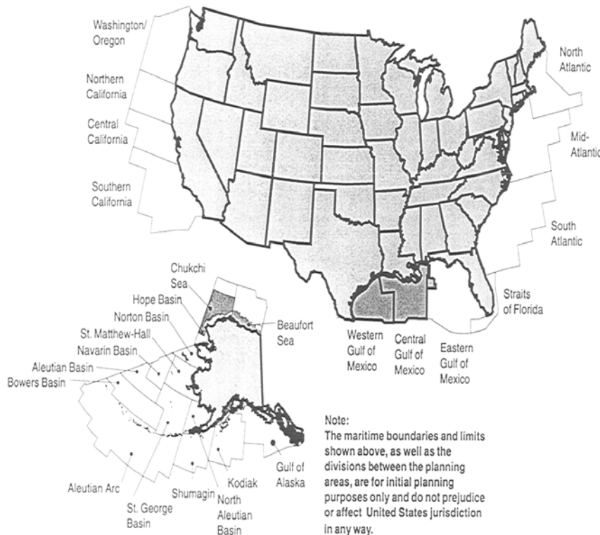
Figure 2. MMS 5-Year Program Areas

The House Resources budget reconciliation package would allow oil and gas lessees holding leases within 100 miles of the coastlines of California and Florida the option to exchange their leases for a new lease between 100 miles and 125 miles off the same state’s coastline. Lessees who want to exchange their lease will be given priority based on the amount paid in bonus bids for the original lease. If a partial lease tract is exchanged for a full lease tract, then an additional bonus payment would be required.