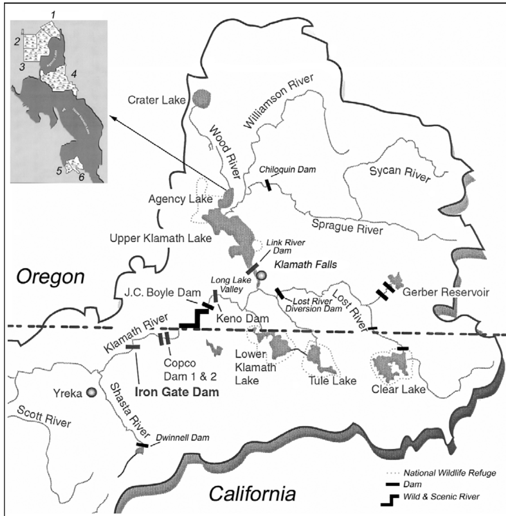
Figure 2. The Upper Klamath Basin

Key: (1) Wood River Ranch, (2) Barnes Ranch, (3) Agency Lake Ranch, (4) Williamson Delta Preserve, (5) Caledonia Marsh, (6) Running Y Marsh