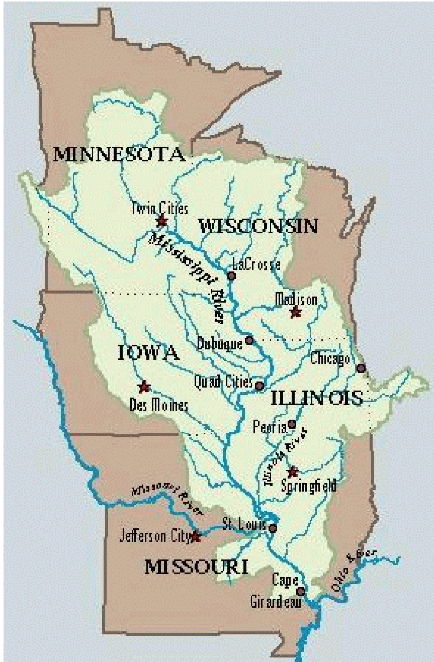
Figure 3. Upper Mississippi and Illinois River Watershed