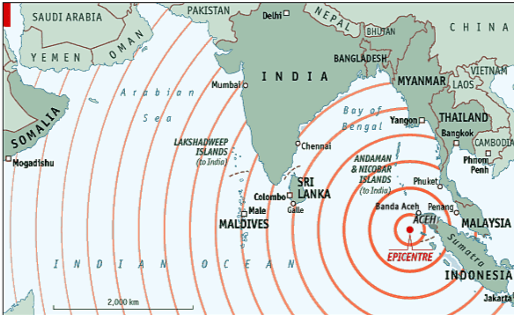
Figure 1. Map of the 2004 Indian Ocean Earthquake and Tsunami