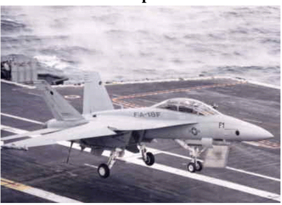
F/A-18F Super Hornet

The F-35 Joint Strike Fighter ( JSF ) began in FY1994 as the Joint Advanced Strike Technology ( JAST ) program, which emerged after cancellations of the AFX and MRF. The JSF program is a long-term effort to design, develop, and produce a family of affordable joint-service fighter/attack planes, with conventional take-off and landing (CTOL) aircraft for the Air Force and Navy and short take-off vertical landing (STOVL) aircraft for the U.S. Marine Corps and the U.K. Royal Navy. In February 2004, Air Force leaders announced that the Air Force would also procure some number of STOVL variants to improve its ability to prosecute the close air support (CAS) mission and reduce the potential implications of uncertain access to forward bases.