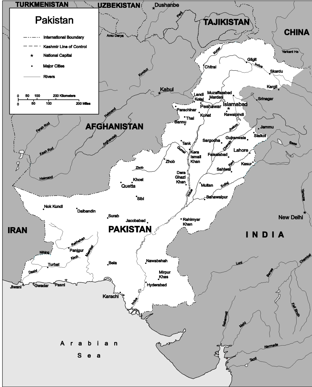
Figure 2. Map of Pakistan