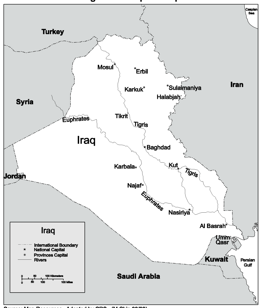
Figure 2. Map of Iraq