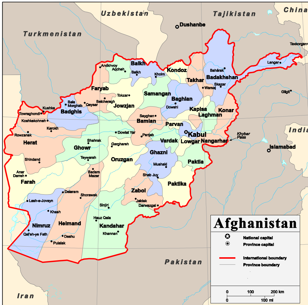
Figure 1. Afghanistan

© MAGELLAN Geographix SM edited by CRS 04/02