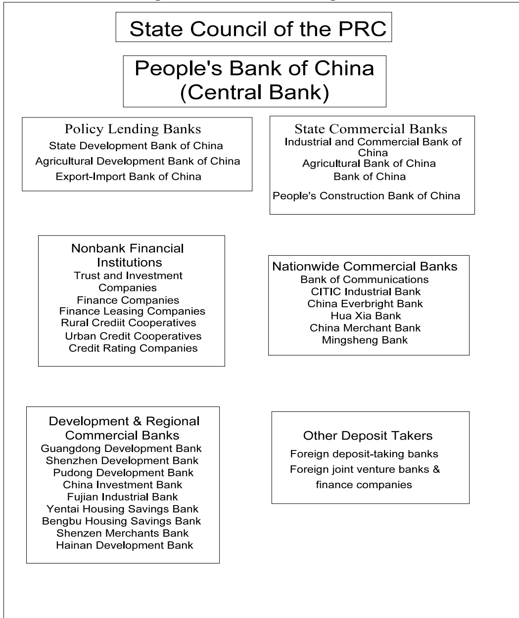
Figure 1. China's Banking Sector

During the second half of the 1990s, China also saw the emergence of a new genre of commercial banks with shares owned by public authorities at various levels of government, including local governments and, in some cases, by private