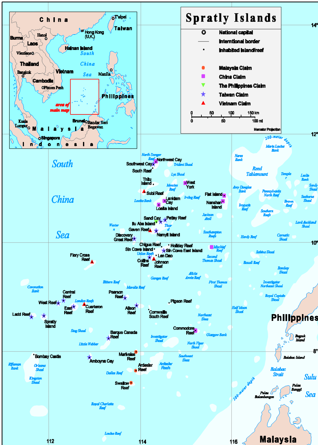
Figure 2. South China Sea