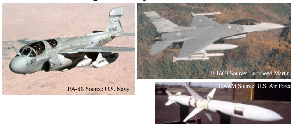
Figure 2. Key SEAD Assets

The primary topic of ECM-related conversation following Operation Allied Force, was widespread praise of towed radar decoys. Although they did not debut in Kosovo, towed decoys were used more pervasively in this conflict than in the past. These ECM were credited with saving several aircraft such as the B-1 bomber from Serbian SAMs. Some have described towed decoys as “...one of the key enablers of last year’s bombing campaign.” 21 However, there were ECM deficiencies as well as successes. The ALE-39 countermeasures dispenser, for instance, was not sufficiently reliable. The ALE-39 – which is found on EA-6B, F-14, F/A-18 and AV-8B aircraft – at times did not dispense countermeasures (flares or chaff) when it was supposed to. Conversely the dispenser also ejected countermeasures without prompting, leaving the pilot with none available when they were needed.