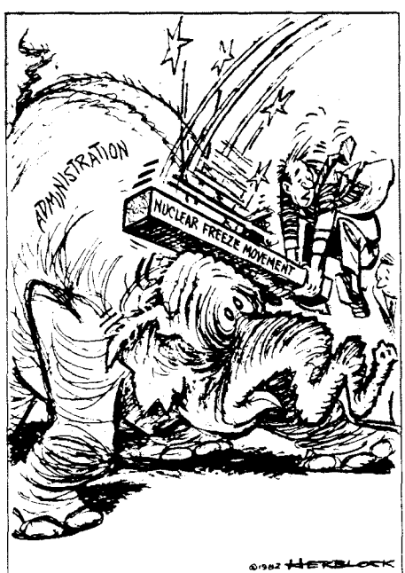
"Well, it got his attention."

Still, some Republican leaders admit uneasiness about the possible impact of the freeze campaign on a number of 1982 congressional elec-