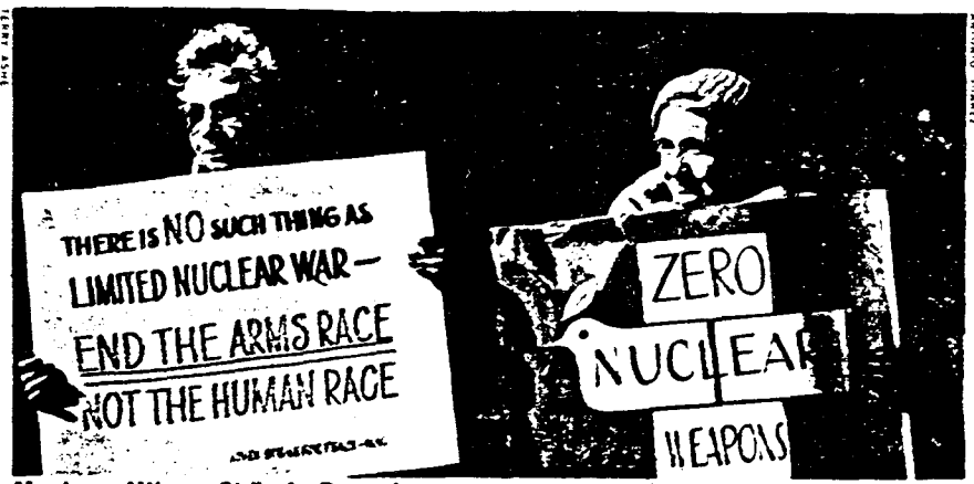
Members of Women Strike for Peace demonstrating on New York's Fifth Avenue

Concerned that Moscow might nonetheless score a propaganda coup with its proposals, the White House released a de-