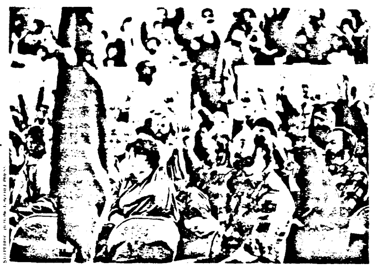
In town meetings, a heavy majority of communities in Vermont and New Hampshire endorsed the nuclear-freeze proposal.

Some pacifists call such gestures "premature" and "po-