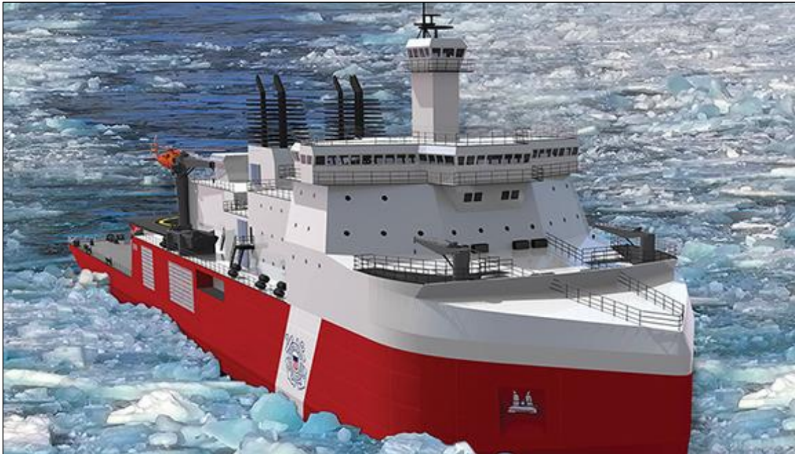
Figure 5. Rendering of Halter Marine Design for PSC