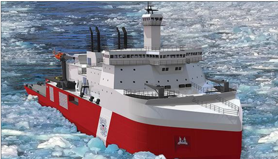
Figure 5. Rendering of Halter Marine Design for PSC