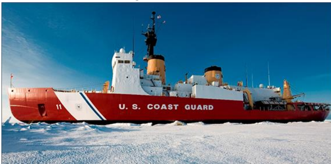
Figure A-2. Polar Sea

Source: Coast Guard photograph that was accessed April 21, 2011, at http://www.uscg.mil/pacarea/cgcpolarsea/img/PSEApics/FullShip2.jpg (link no longer active). The photograph accompanies Associated Press, “Reprieve for Seattle-Based Icebreaker Polar Sea,” KOMO News, June 15, 2012, posted at https://komonews.com/news/local/reprieve-for-seattle-based-icebreaker-polar-sea .