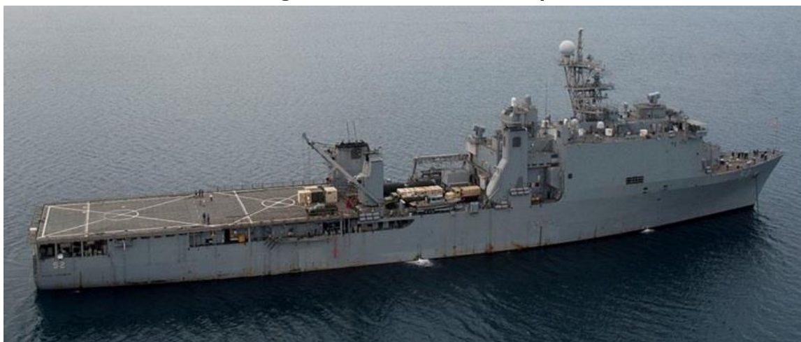
Figure I. LSD-41/49 Class Ship