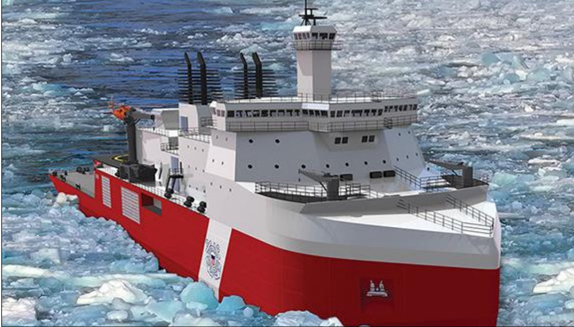
Figure 5. Rendering of Halter Marine Design for PSC