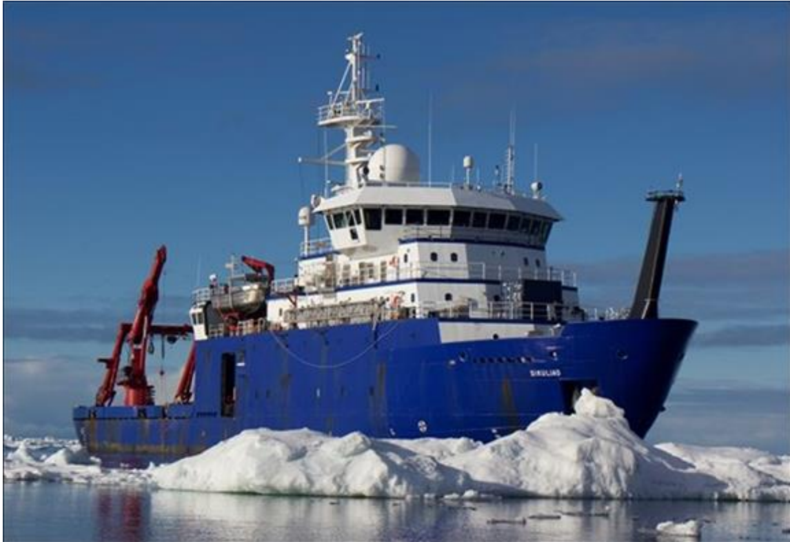
Figure A-6. Sikuliaq