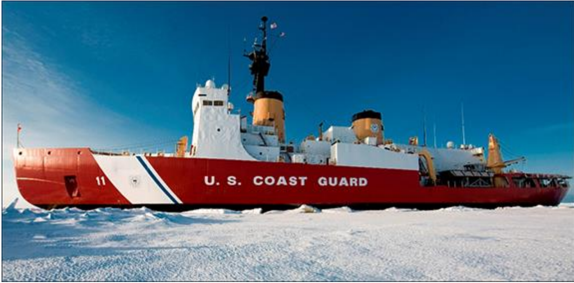
Figure A-2. Polar Sea

Source: Coast Guard photograph that was accessed April 21, 2011, at http://www.uscg.mil/pacarea/cgcpolarsea/img/PSEApics/FullShip2.jpg (link no longer active). The photograph accompanies Associated Press, “Reprieve for Seattle-Based Icebreaker Polar Sea,” KOMO News, June 15, 2012, posted at https://komonews.com/news/local/reprieve-for-seattle-based-icebreaker-polar-sea .