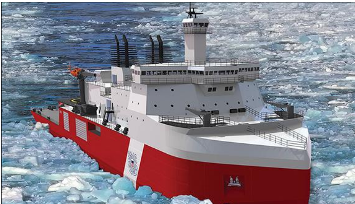
Figure 5. Rendering of Halter Marine Design for PSC