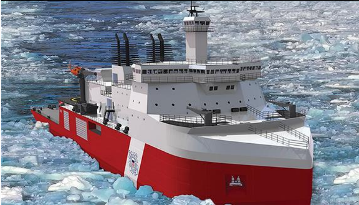
Figure 5. Rendering of Halter Marine Design for PSC