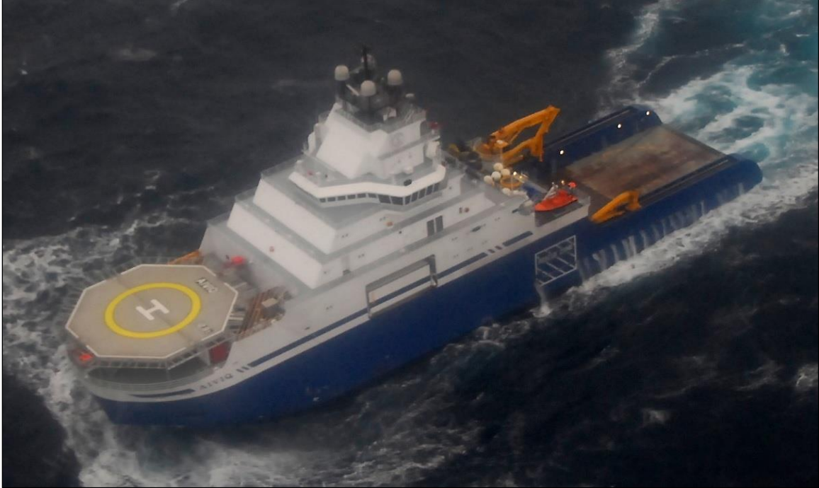
Figure A-8. Commercial Ship Aiviq